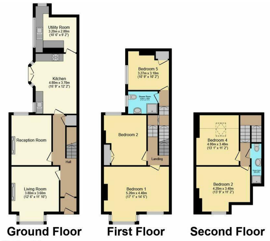
Total floor area 163.7 m² (1,762 sq.ft.) approx

This floor plan is for illustrative purposes only. It is not drawn to scale. Any measurements, floor areas (including any total floor area), openings and orientation are approximate. No details are guaranteed, they cannot be relied upon for any purpose and they do not form part of any agreement. No liability is taken for any error, omission or misstatement. A party must rely upon its own inspection(s). Powered by www.focalagent.com