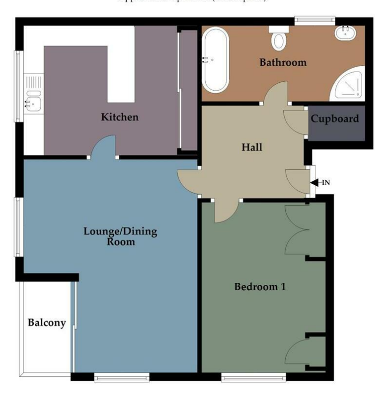
Total area: approx. 61.7 sq. metres (664.5 sq. feet)

Approx. 61.7 sq. metres (664.5 sq. feet)