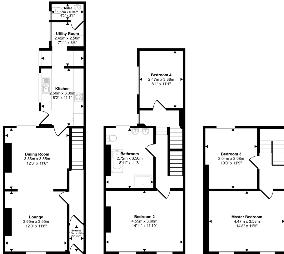
Ground Floor Approx 50 sq m / 536 sq ft