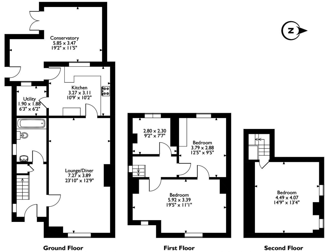
Please note that the location of doors, windows and other items are approximate and this floorplan is to be used for illustrative purposes only. Unauthorized reproduction is prohibited.