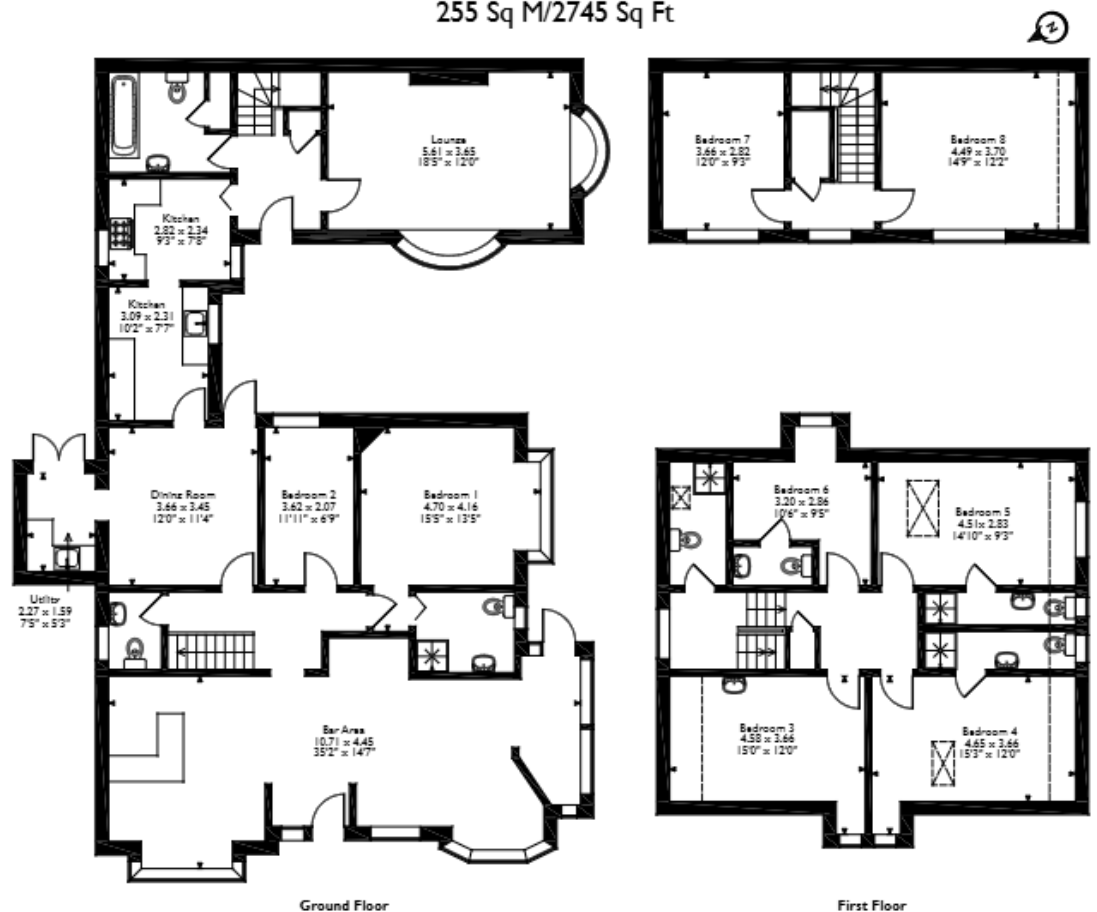
Please note that the location of doors, windows and other items are approximate and this floorplan is to be used for illustrative purposes only. Unauthorized reproduction is prohibited.